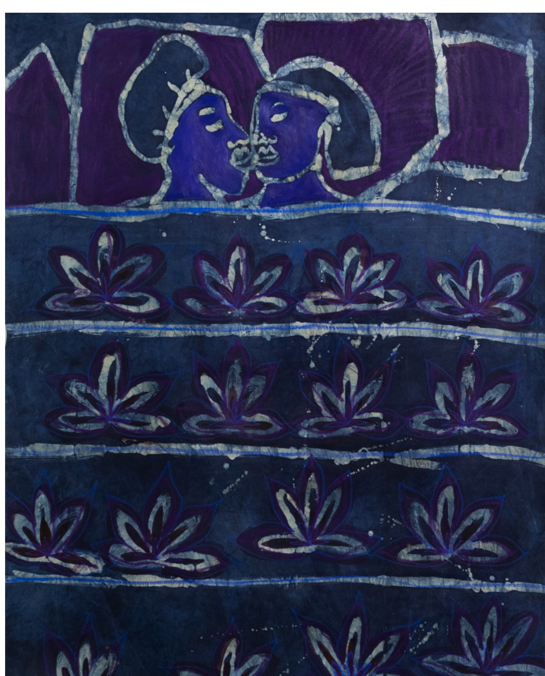
Goodnight Kiss

I think the wooden bars that I've chosen to hang my works with are great for this bed theme. For me when I look at them I see the painting extended, I see the bars as the frame of the bed. The way it hangs looser brings it back closer to the textiles that have influenced my work.